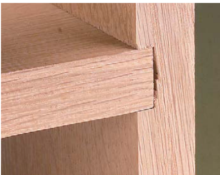
▲ Bad. A wobble dado set leaves a concave surface which can create large, unsightly gaps. Not only is this ugly, but the joint is not as strong.

THE SOLUTION. So how do you do it? I've found the best solution to be a combination of a hand-held router