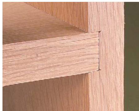
▲ Better. With stacked dado sets, the outside blades can leave score marks on the sides of the dado. While this doesn't weaken the joint, it's still noticeable.