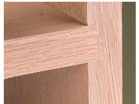
▲ Best. To get the tightest, best-looking dado joint, use a dado clean-out bit in a hand-held router. The top-bearing bit is guided by the sides of the dado.